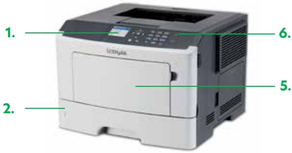
M1145 with 2.4-inch LCD screen