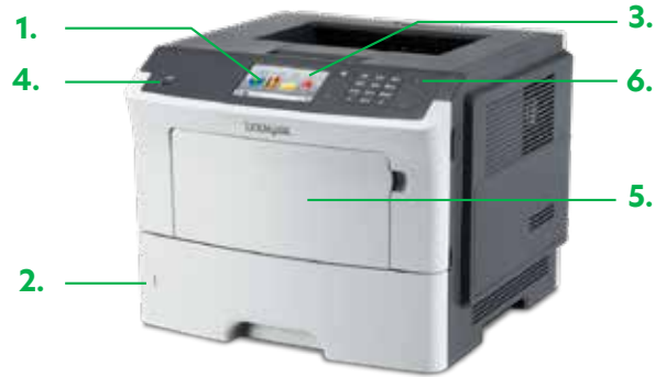
M3150 with 4.3-inch color touch screen